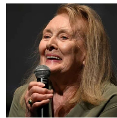
French author Annie Ernaux won the Nobel Prize in Literature

Her work is uncompromising and written in plain language, and scraped clean. "And when she with great courage and clinical acuity reveals the agony of the experience of class, describing shame, humiliation,