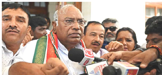
Agency New Delhi, Oct 19: