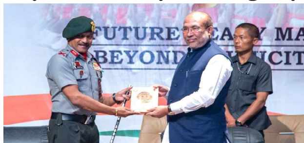
IT News Imphal, Oct 19:

Chief Minister N. Biren Singh maintained that his Government's commitment, since its formation in 2017, was to bring bandh and blockade free in the State with improved law and order. His first priority as a Chief Minister was to bridge the gap between hill and valley and also among various communities, he added.