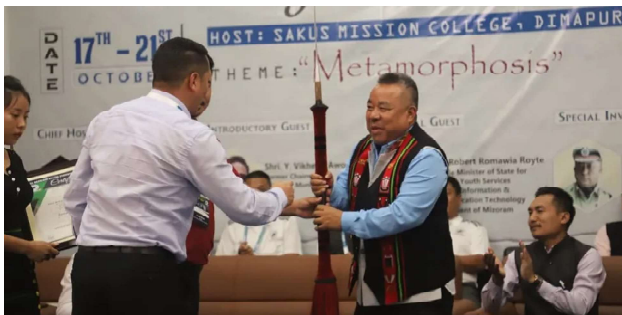
Agency Dimapur, Oct 19:

Mizoram sports minister Robert Romawia Royte has said the efforts made by Nagaland government headed by chief minister Neiphiu Rio and other organisations towards finding permanent solution to the Naga issue deserves reciprocal response from the Centre.