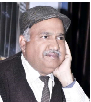
By: Vijay Garg

Global warming poses a serious threat to the Earth's sources of oxygen and water. The smallest organisms living in the oceans play a big role in the life cycle of the Earth. Our biological and environmental systems are dependent on these organisms. You will be surprised to know that many of these organisms also produce oxygen on a large scale for the earth. But the increasing acidification of the oceans due to climate change has made it difficult for these microbes. A crisis has arisen. These