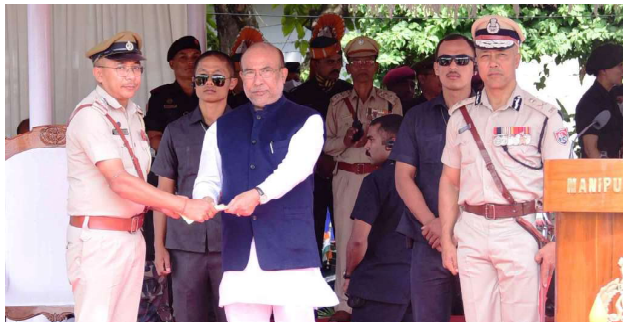
IT News Imphal, Oct 19:

Chief Minister N. Biren Singh appreciated all the Manipur Police personnel for their dedicated hard work towards maintaining proper law and order in the State. The Chief Minister was addressing the gathering at the observation of 131st Manipur Police Rising Day 2022 at the 1st Battalion Manipur Rifles Parade Ground today.